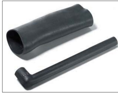
333F322-385 Series supplied / fully recovered.

The boot provides connector strain relief in applications with partially loaded connectors, resulting in small cable diameters requiring a high shrink ratio.